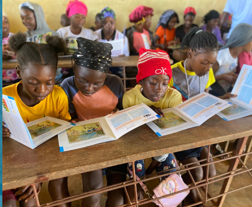
3000 Books Distributed in Haiti '25